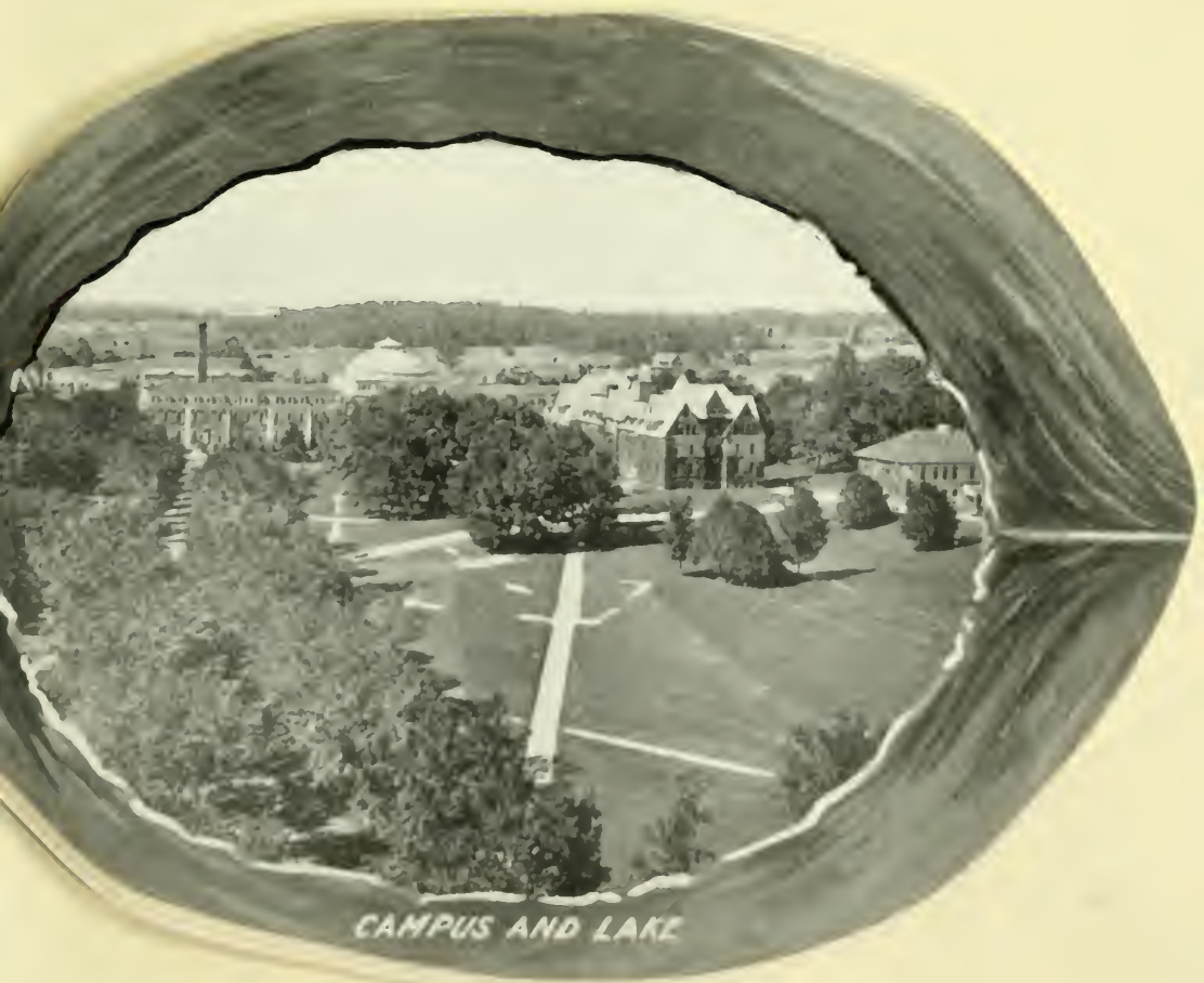
CAMPUS AND LAKE